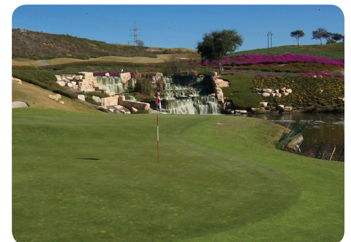
Water reuse benefits the region's golf courses including The Crossings at Carlsbad.