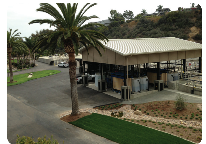
Recent construction of advanced water treatment facilities at the San Elijo Water Reclamation Facility allows for increased recycled water production using high-salinity supplies.