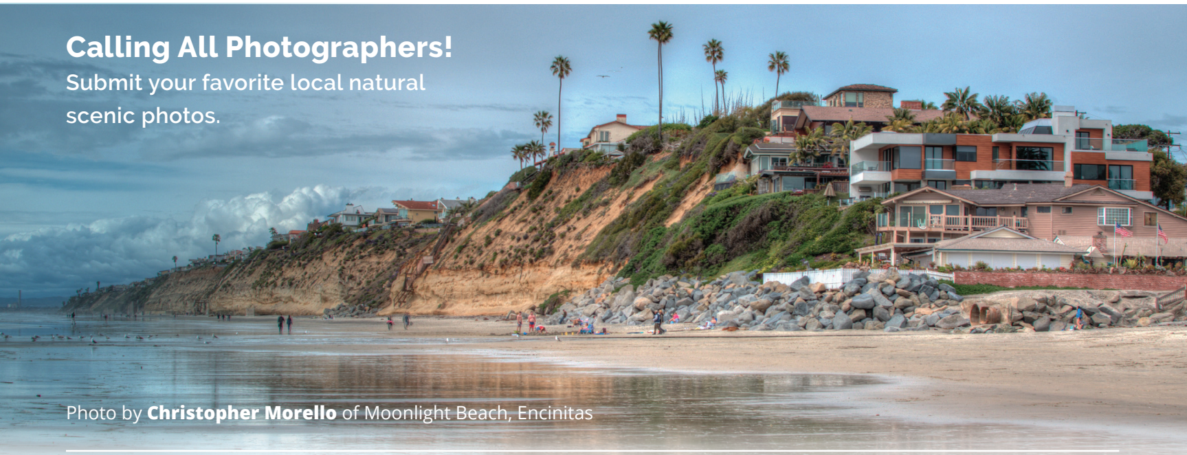
of Moonlight Beach, Encinitas