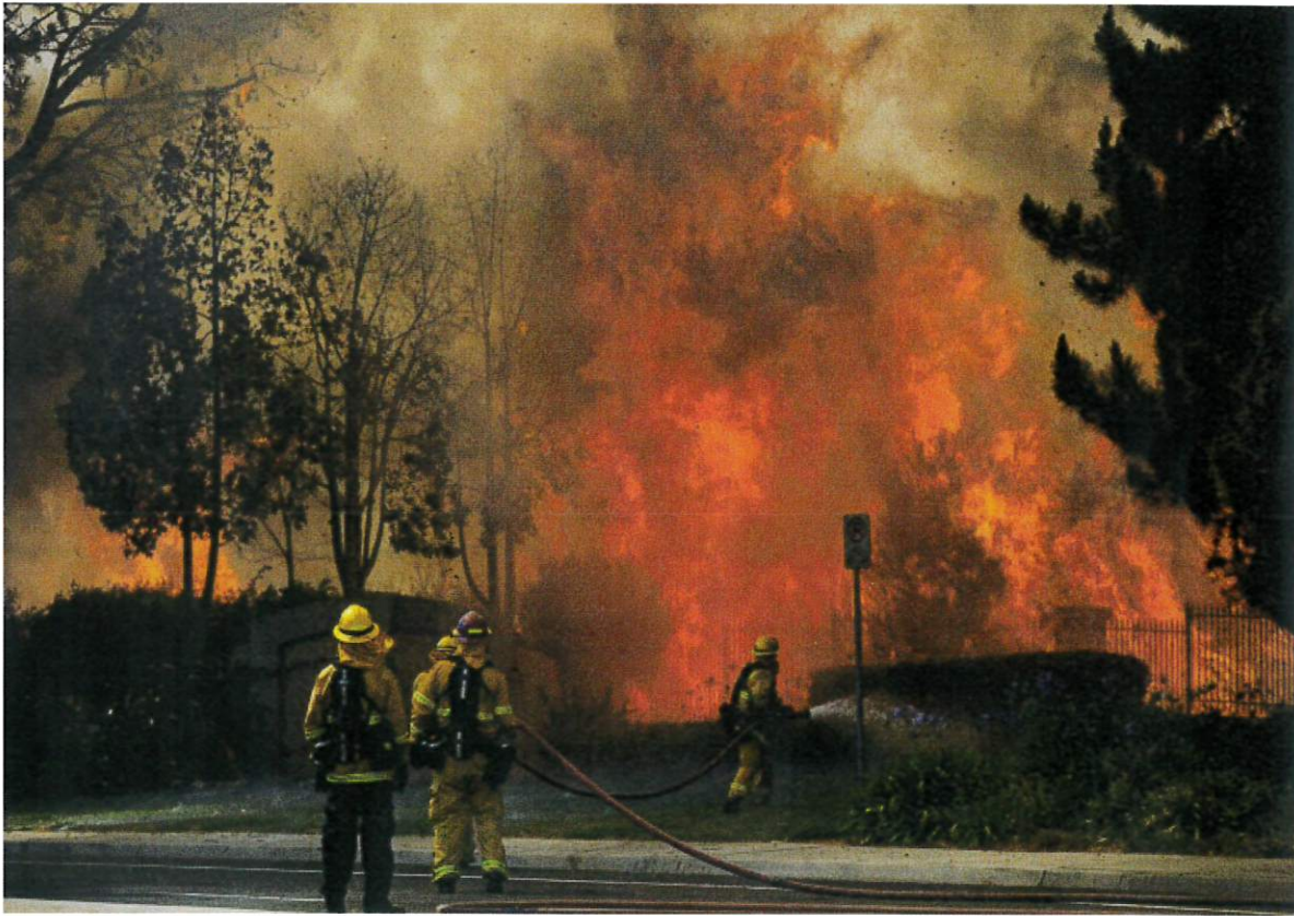
Firefighters tackle the Poinsettia fire in Carlsbad, California