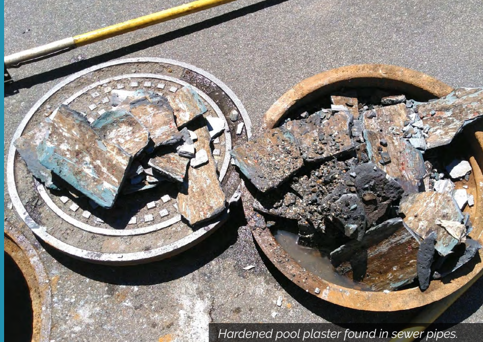
Hardened pool plaster found in sewer pipes.

This is a reminder to homeowners or contractors to properly dispose of the remaining pool plaster and to not pour pool plaster down the drain or into your home's cleanout. Pool plaster hardens in pipes, and it has the potential to cause pipeline blockages that can lead to sewer spills or sewer backups in your home. Please contact us at (760) 753-0155 for more information or to report a sewer problem.