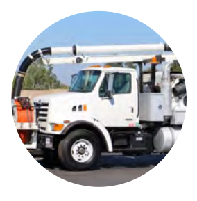
No vehicle accidents for three years