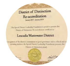
The District was recertified as a District of Distinction by the California Special Districts Association.