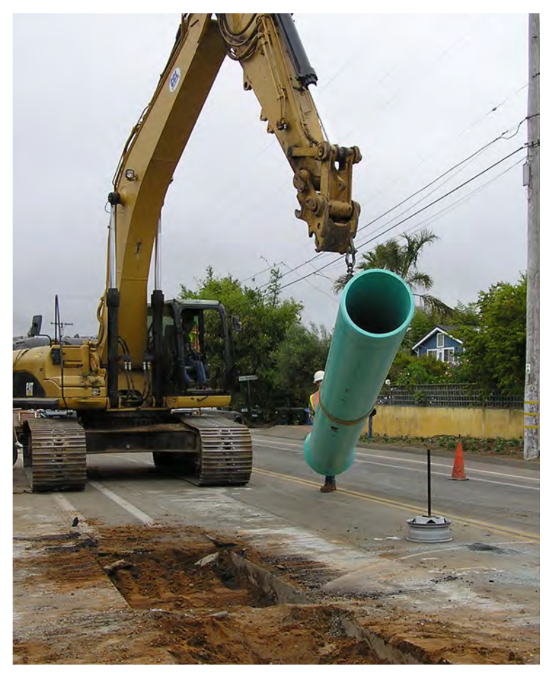
The Force Main Project Team lays down a 24" diameter PVC pipe along La Costa Avenue. Made of chemically stable polyvinyl chloride, the new pipeline will last 50+ years.

Another significant project completed this summer was the replacement of the Village Park 5 (VP5) pump station. Originally constructed in 1974, it is located in the City of Encinitas on the west side of Encinitas Boulevard, just south of Willowspring Drive. In 2014 we completed a pump station assessment and VP5 was scheduled for replacement due to its age, the fact that spare parts are no longer available, and to provide a safer working environment for staff. The new VP5 is easier to maintain and operate, and it's more energy efficient.