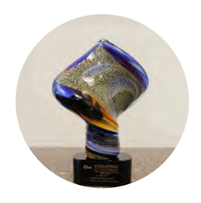
The District won the California Association of Sanitation Agency's Small Agency Public Outreach and Education Project of the Year Award.