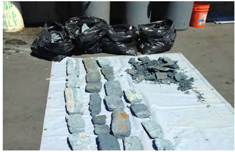
Hardened pool plaster removed from LWD sewer pipes.