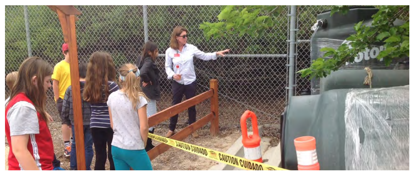
El Camino Creek Elementary School students learn about capturing and reusing rainwater.

A mainstay of our public outreach efforts continues to be helping our teachers educate local kids. Two local teachers received grants this spring to help enhance their educational plans: