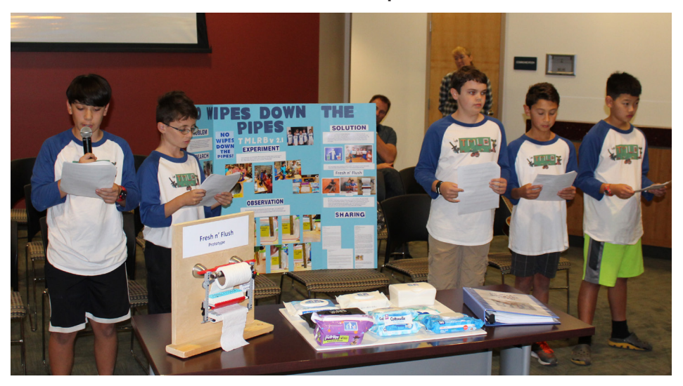
FIRST Lego League Robotics TRLMBv2 presents their project on wet wipe

do not break down in the sewer system. Their presentation to our Board of Directors was in preparation for a FIRST Lego League Tournament on hydrodynamics. The team completed experiments with 8 different brands of wet wipes to see how well they break down and rated them. They discovered that none of them broke down as well as toilet paper.