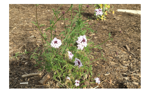
Lilac Verbena Verbena lilacina