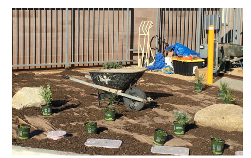
Planting of Assorted Natives

San Diego Chapter of the California Native Plant Society: <a href="http://www.cnpssd.org">www.cnpssd.org</a> Ocean Friendly Gardens program by Surfrider: <a href="http://www.surfrider.org/programs/ocean-friendly-gardens">www.surfrider.org/programs/ocean-friendly-gardens</a>