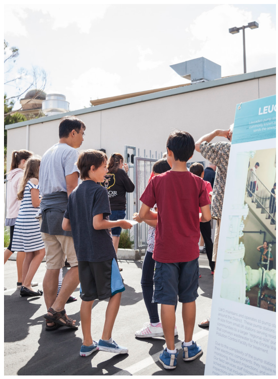
Preparing for a tour of the Leucadia Pump Station at the 2017 Open House