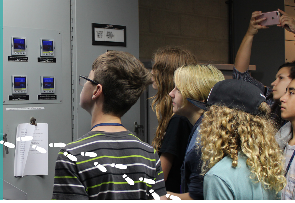
Aviara Oaks school tour in the Leucadia Pump Station

These young men took field trips to our Gafner Water Reclamation Facility and toured the Point Loma Wastewater Treatment Plant to see firsthand how despite claims on the labels — wet wipes