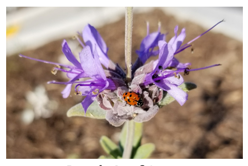
Purple Leaf Sage Salvia macrophylla