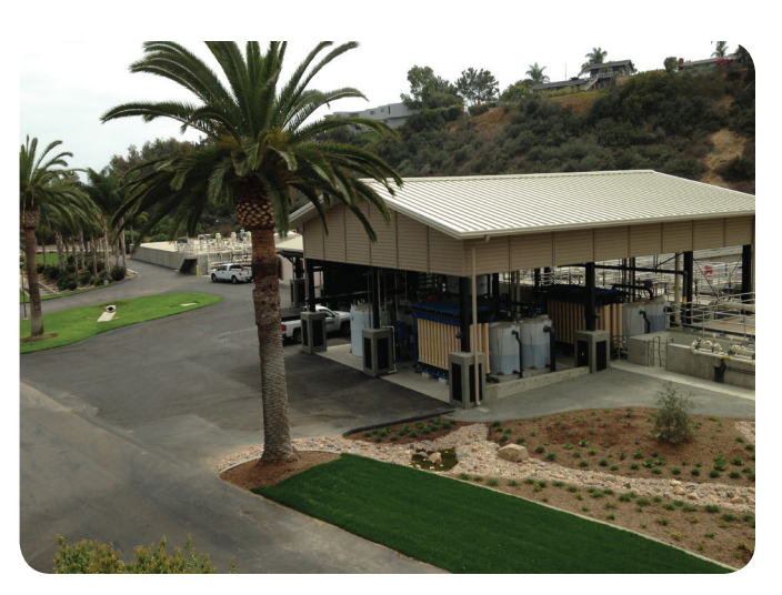
Recent construction of advanced water treatment facilities at the San Elijo Water Reclamation Facility allows for increased recycled water production using high-salinity supplies.