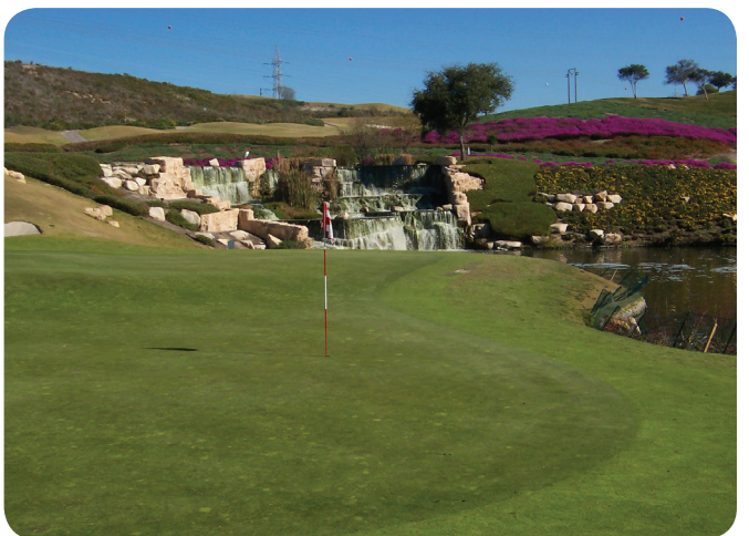
Water reuse benefits the region's golf courses including The Crossings at Carlsbad.