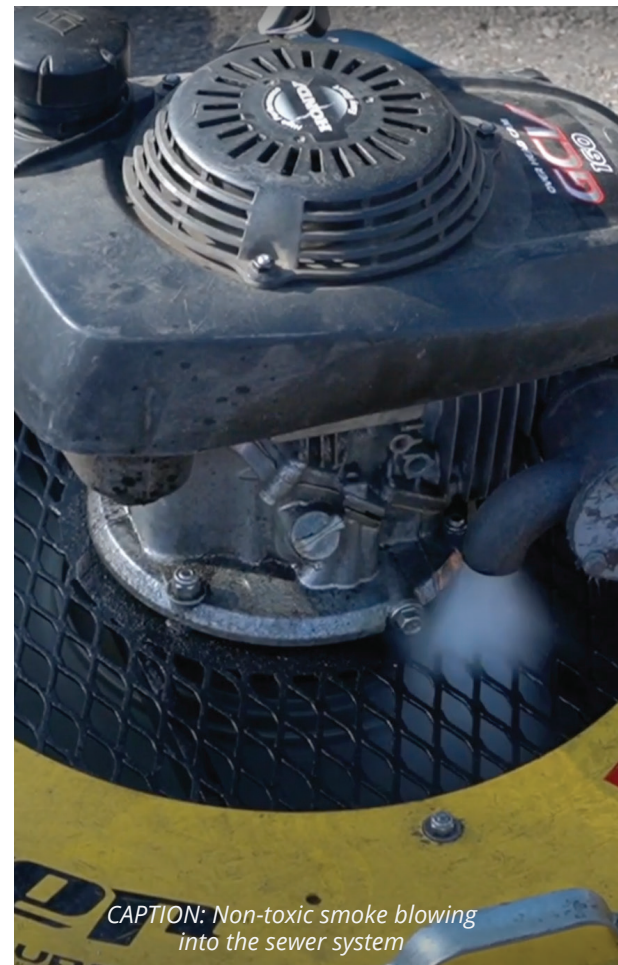
CAPTION: Non-toxic smoke blowing into the sewer system

The results indicated that there were over 50 sewer defects on private property, as well as a few improper connections. The majority of these defects consisted of broken private laterals and cleanouts, and have been addressed by the homeowners. We appreciate the homeowners working with the District to resolve these issues. As a courtesy, the District is assisting homeowners by replacing their broken or missing clean-out caps located on their property.