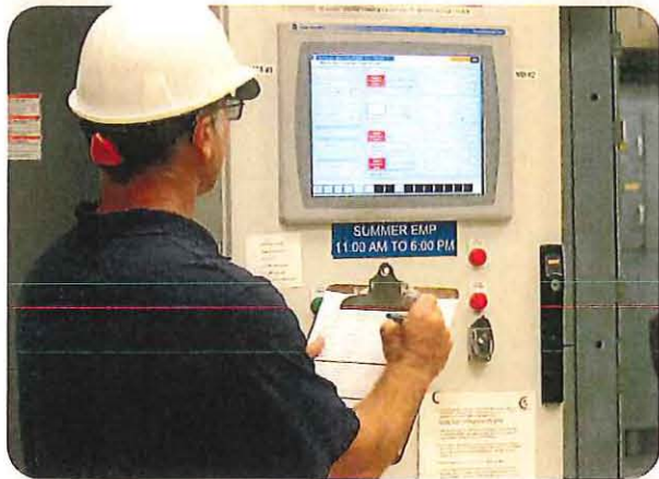
An Encina operator checks power sources for the plant. Nearly 80% of the plant's power needs are generated onsite.