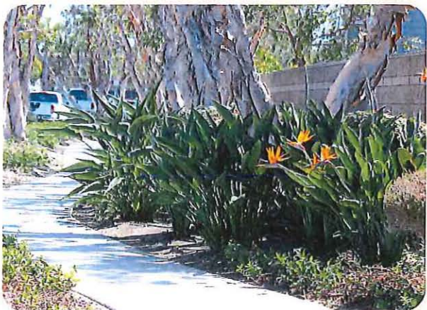
Recycled water keeps landscaping green and growing despite our drought conditions, saving valuable potable water supplies for other uses.