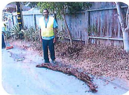
This giant root was pulled out of a LWD pipeline after a homeowner's lateral was cleaned out.

LWD offers a Homeowners Lateral Grant Program to provide financial assistance to help defray the cost of lateral repairs. Laterals are the sewer pipelines that run from a home or other building to the main sewer pipeline in the street. LWD encourages homeowners to have their laterals video-inspected by a licensed plumber at least every 5 years to help ensure there are no spills or, worse, sewer backups into your house. Over time, tree roots or other obstructions can block the lateral and cause these problems. If it is found that your lateral needs repair, LWD's Lateral Grant Program will reimburse 50% of the repair cost, up to a maximum of $3,000. For more information on this program, please review the application on LWD's website at www.lwwd.org . And please call us at (760) 753-0155 before your plumber cleans out your pipeline so that we can dispatch personnel and equipment to your home or business to catch any debris before it can block the main pipeline. Roots and other debris can be pushed into LWD's main pipeline and cause blockages or spills downstream.