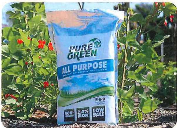
A bag of Pure Green soil amendment sits in the demonstration garden at Encina. Pure Green helps keep the garden blooming beautifully!