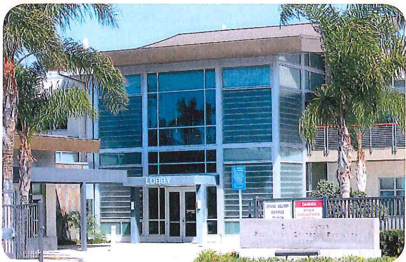
Encina Wastewater Authority, located along the coast in Carlsbad.