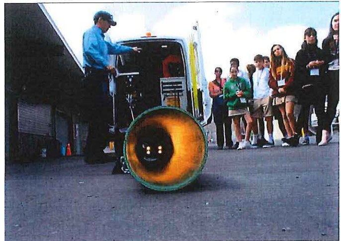
Students get familiar with our pipe-crawling robot, just one of the many cool technologies we use

Tours offer an opportunity for the community to meet the people who protect our coastline day in and day out, and learn about the mechanical, electrical, and biological aspects of protecting our environment! The Gafner Treatment Plant is a living lab and we love hosting community groups, teachers and curious young minds who want to see what they learn in school in action. Tour information available at info@lwwd.org .