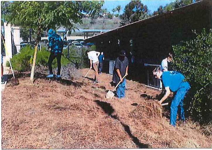
La Costa Canyon High Students break ground for a drought tolerant garden

Educational Opportunities, the "Living Lab" at LWD & Tours