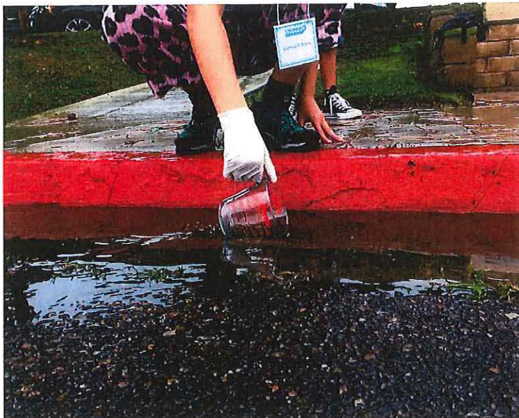
Students taking samples of storm water for tasting

Jennifer Smith from El Camino Creek Elementary will design and build a Hydroponic Garden