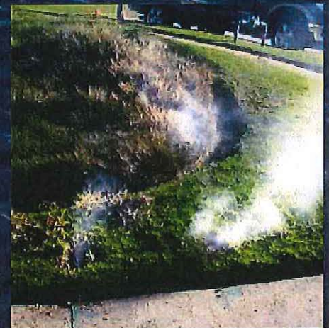
Smoke drifting from cracked pipes

As we continue with our smoke testing you will receive a notification from us prior to the actual tests in your area with dates, specific information about testing, and our contact information. In the future, you might even see a drone or two buzzing overhead to help identify system discrepancies. This is a cost-effective way to maintain the system.