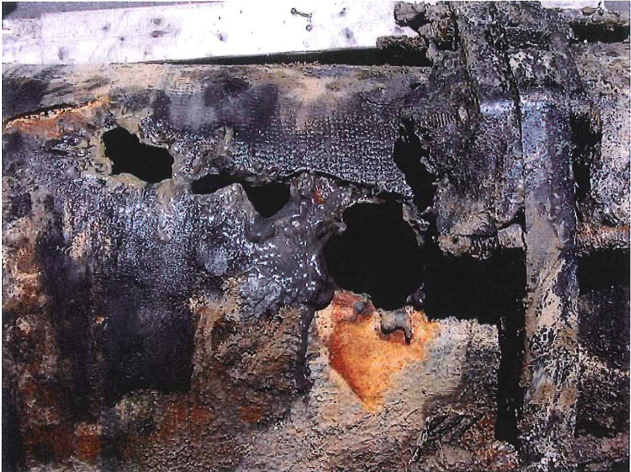
Photo of Failed Surge Tank Line